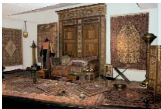
The Museum of Art Collections, Bucharest