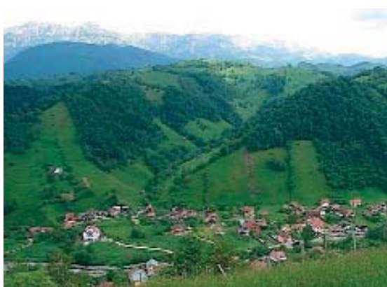
Moeciu seen fro the Rucăr Pass