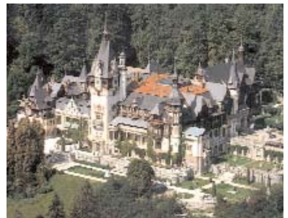
The Peleş Castle in Sinaia