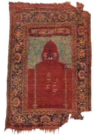
Kula prayer rug - formerly in the Lutheran Church of Rosenau