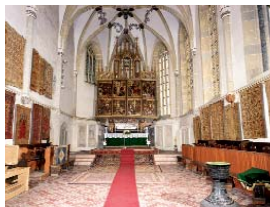
St. Margaret Church in Mediaş