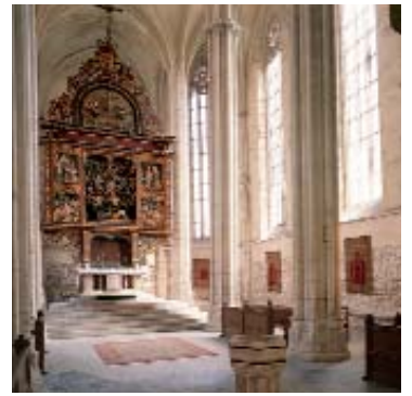
The Lutheran Church in Sebeş