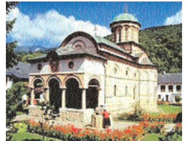
Cozia Monastery 14th cent.