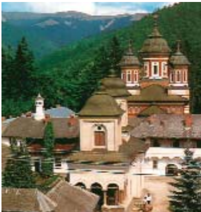
The Orthodox Monastery in Sinaia