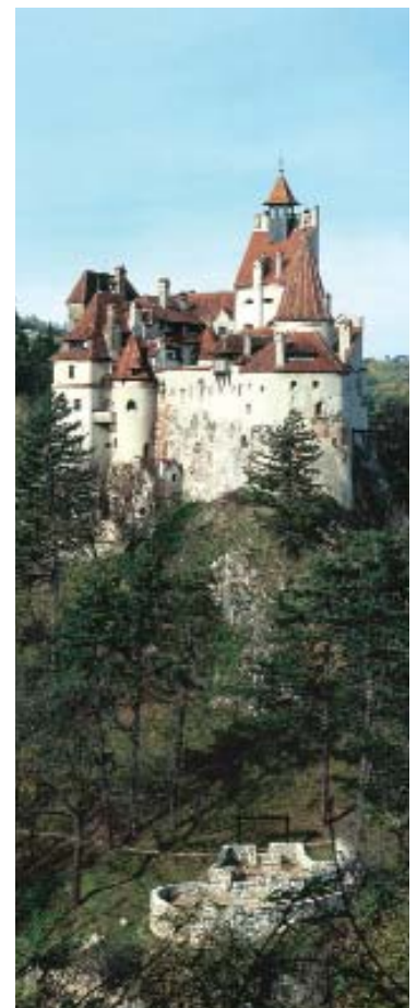
The 'Dracula' Castle in Bran