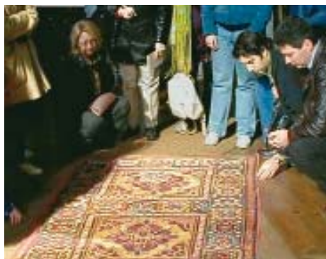
Study of a Ghirlandaio rug