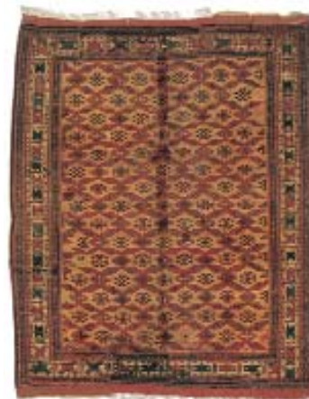
Unique Star-lattice rug, late 15th century, in Sighişoara