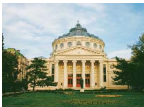
The Atheneum, built 1870