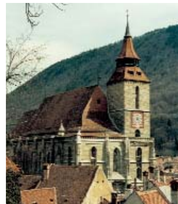
The Black Church in Braşov