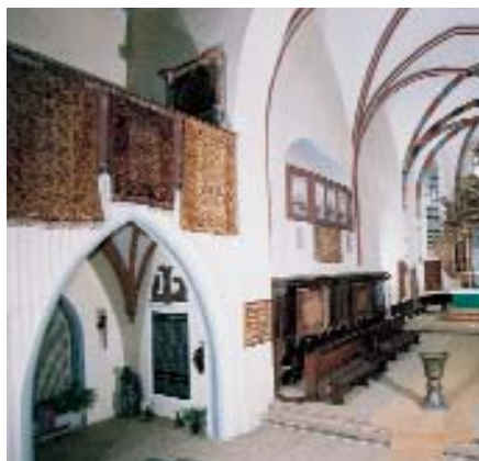
The Monastery Church in Sighişoara