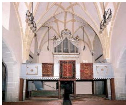
The Lutheran Church in Hönigberg