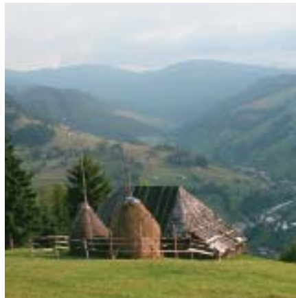
Landscape in the Carpathians