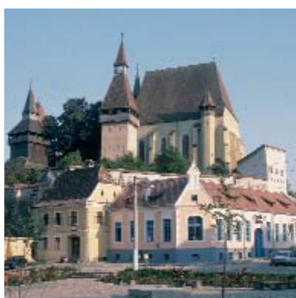
The Lutheran Church in Biertan