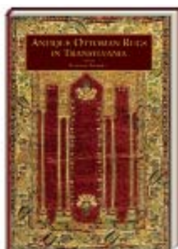
Stefano Ionescu's book showing over 300 rugs from Transylvania