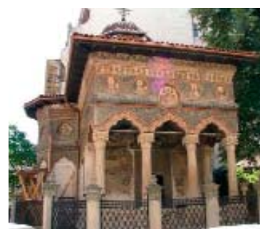
Stavropoleos Church Bucharest

★ 8:00 p.m. - Dinner at the Restaurant of the hotel with a selection of Turkish and Balkanic specialities.