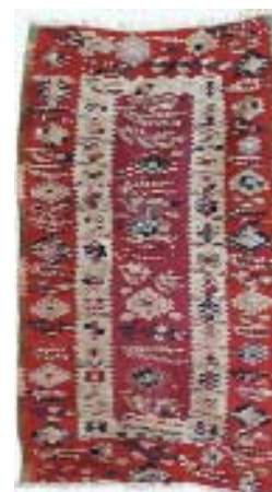
A' scoartza' from Oltenia MRP, Bucharest

★ 8:00 p.m. - Dinner in a traditional restaurant with Romanian menu.