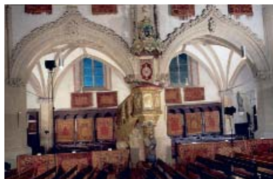
Ottoman prayer rugs in the Black Church